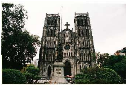
St. Joseph's Cathedral, Hanoi