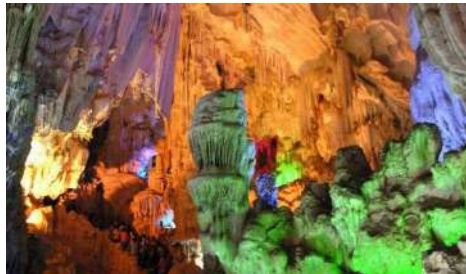
Paradise Palace cave