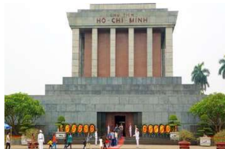
Ho Chi Minh Museum